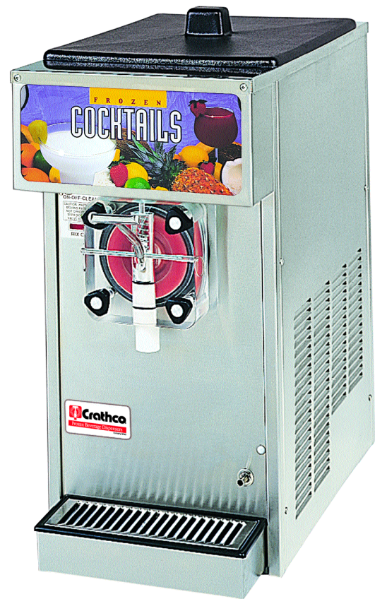
MODEL 3311 or 3511

Available with your choice of back-lit header!