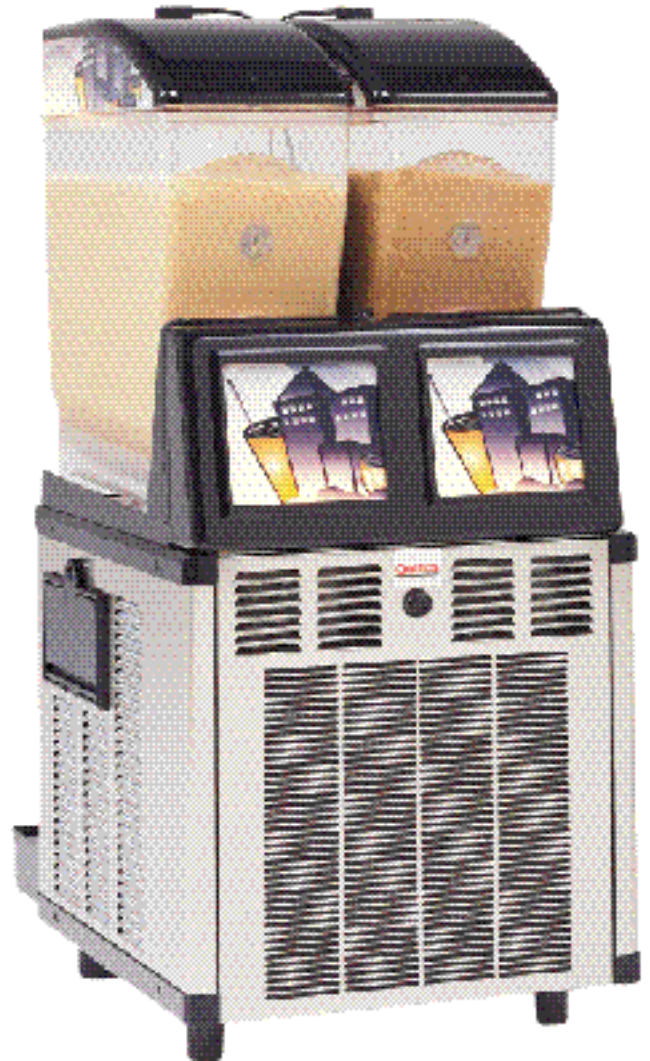
MODELS G23-2B and MG23-2B

Featuring new optional electronic touchpad controls, superior merchandising and a unique multi-cool system for faster cool down.